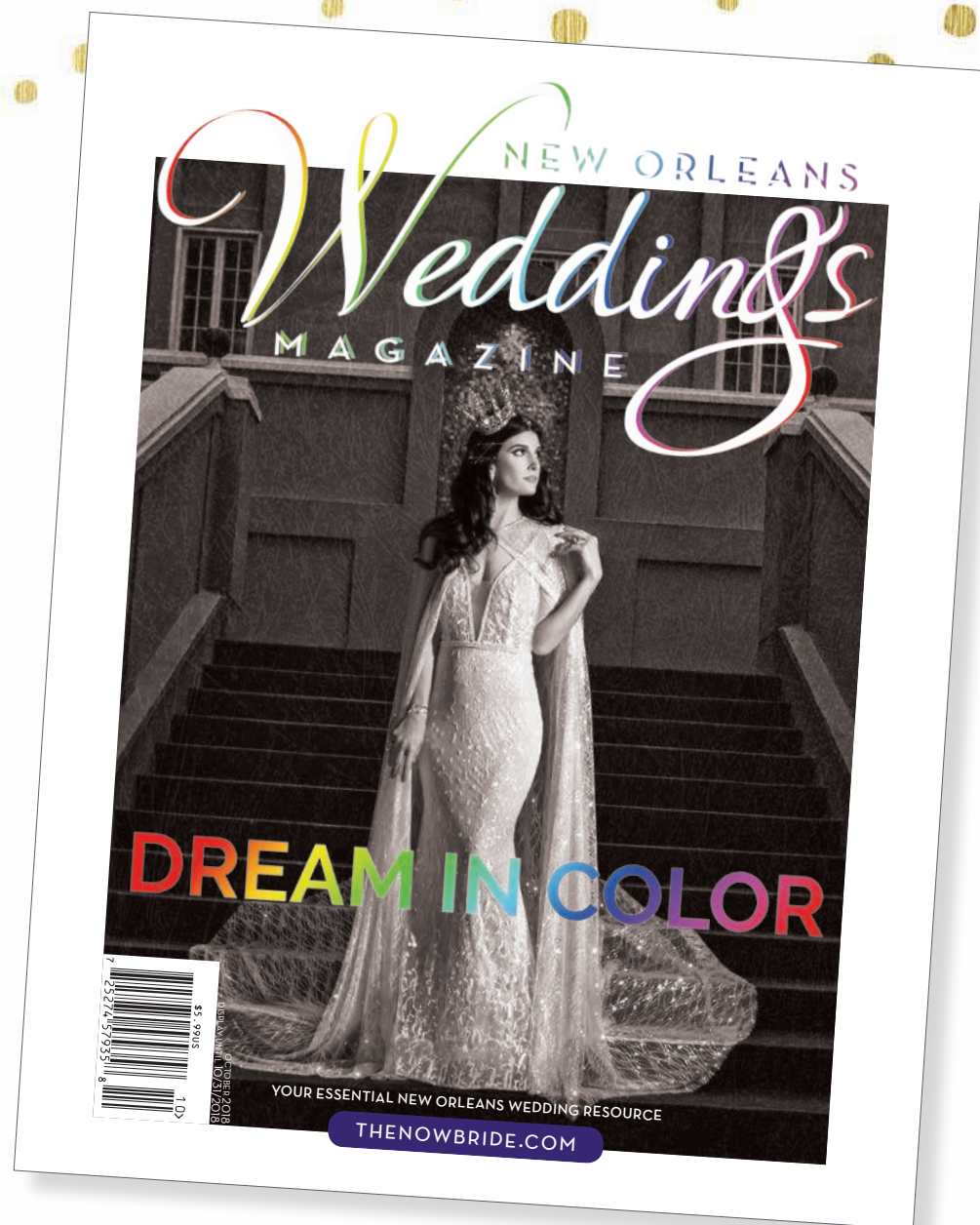
FEATURED 2018 FALL+WINTER EDITION COVER, "DREAM IN COLOR" EDITORIAL ON LOCATION: W NEW ORLEANS - FRENCH QUARTER | GOWN: MAEME THE BRIDAL BOUTIQUE | HAIR AND MAKEUP: TRACY BRANCH AGENCY | JEWELRY: KENDRA SCOTT | ENGAGEMENT RINGS: BRILLIANCE IN DIAMONDS | MODEL: JULIE HUESMAN

GIVE US A RING: 504-832-2775 EMAIL: INFO@THENOWBRIDE.COM